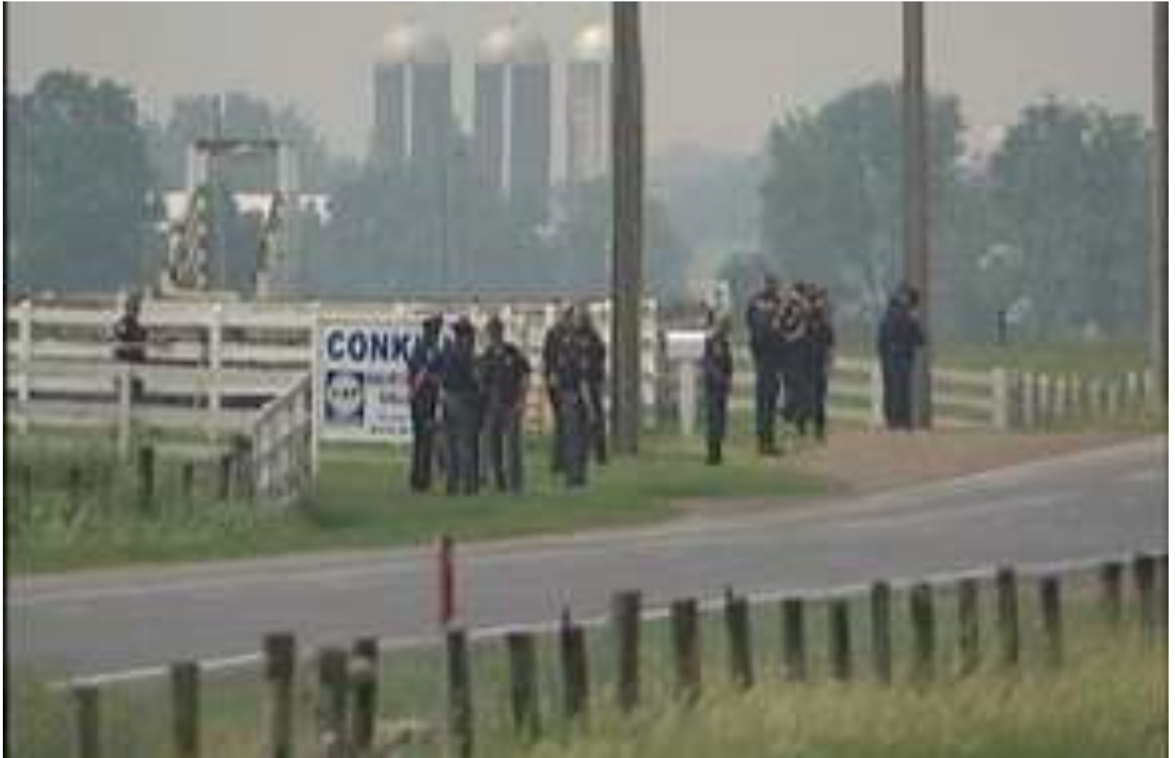
Conklin Dairy Cattle Sales, LLC